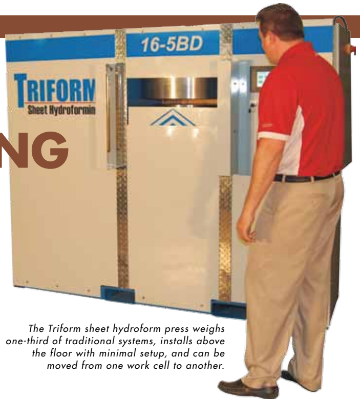
The Triform sheet hydroform press weighs one-third of traditional systems, installs above the floor with minimal setup, and can be moved from one work cell to another.

For example, think outside the box for a moment on hydroforming applications in the medical industry. Just as a doctor's office at the turn of the twentieth century now seems completely unfamiliar to us in the 21st century, the physician's office of the future could be very different from today. The vast array of high-tech equipment that Dr. Tomorrow will use could include a future portable hydroforming press that could